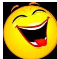
LAUGH IT OFF!!!

Then he began to thank God for the food. He gave thanks for the turkey, the dressing, the fruit salad, the cranberry sauce, the pies, the cake, even the Cool Whip.